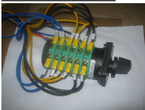
NEW PART NO: SWS-E35F-10