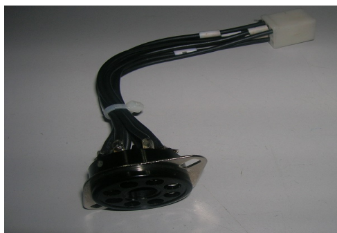
CONVERTER P/N: SWRH-T15K-2 (MC TIMER WIRE HARNESS SET(LEAD CONNECTOR SOCKET)