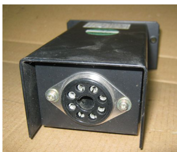
OLD P/N: SCBA-T15K-1