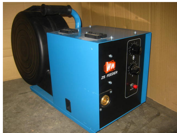
New Part Number: 2499