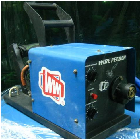
Old Part Number: 2103 - 2299